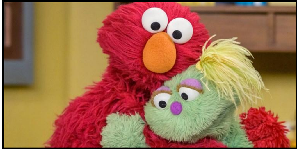
Sesame Street's newest Muppet has a mother who struggles with addiction

sesamestreetincommunities.org/topics/traumatic-experiences